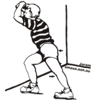
25. Gastrocnemius Stretch (keep knee straight and heel down, feet facing forward)