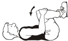
13. Lumbar Flexion Stretch (be gentle if sore)