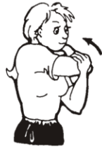
8. Supraspinatus Stretch (keep elbow parallel to ground)