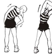
11. Lateral Flexion Stretch (one side, then the other, push pelvis across as you bend)