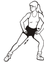
22. Adductor Stretch (keep foot pointing forward, lunge sideways on bent knee, keep back straight)