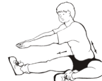
16. Hamstring Stretch (commence with knee slightly bent, then push knee straight as tension allows, push chest towards foot)