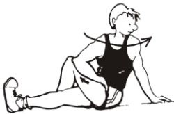
19. Gluteal and Lumbar Rotation Stretch