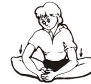
17. Adductor Stretch (push down with elbows on knees very gently, keep back straight)