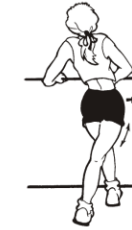
24. Tensor Fascia Stretch (continue to push bottom forward, whilst pushing hip to the side)